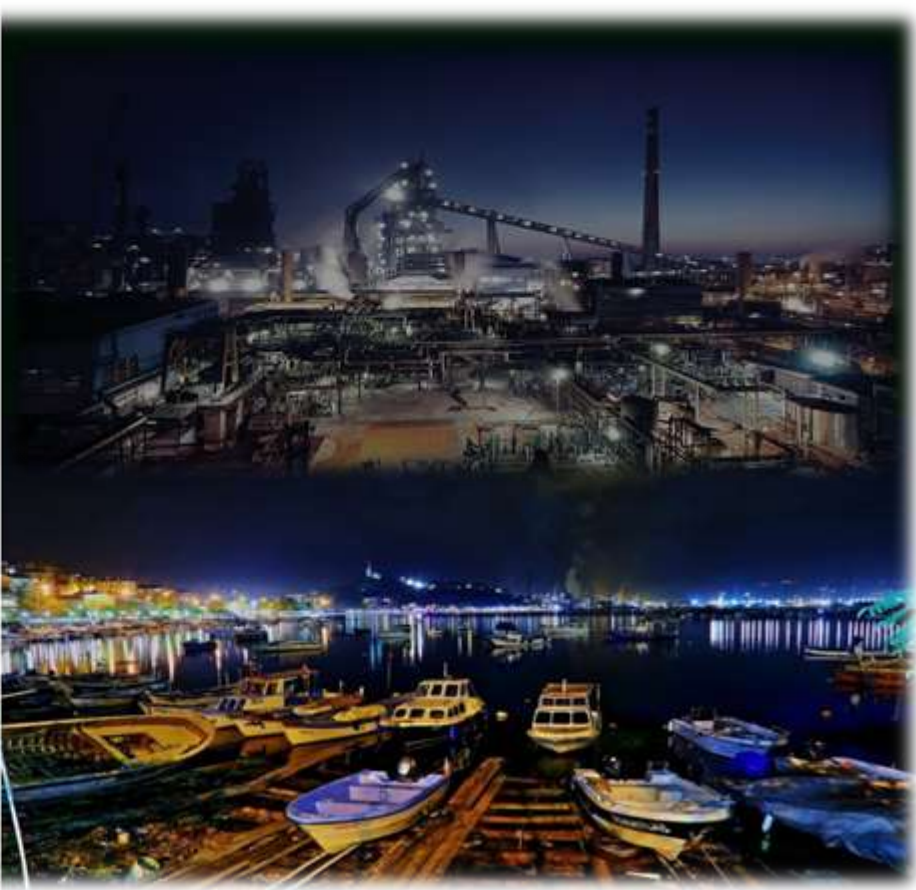
Ereğli is a district of Zonguldak. It has Ereğli Iron-Steel factory and most of the people work in here. It is also a small port city.