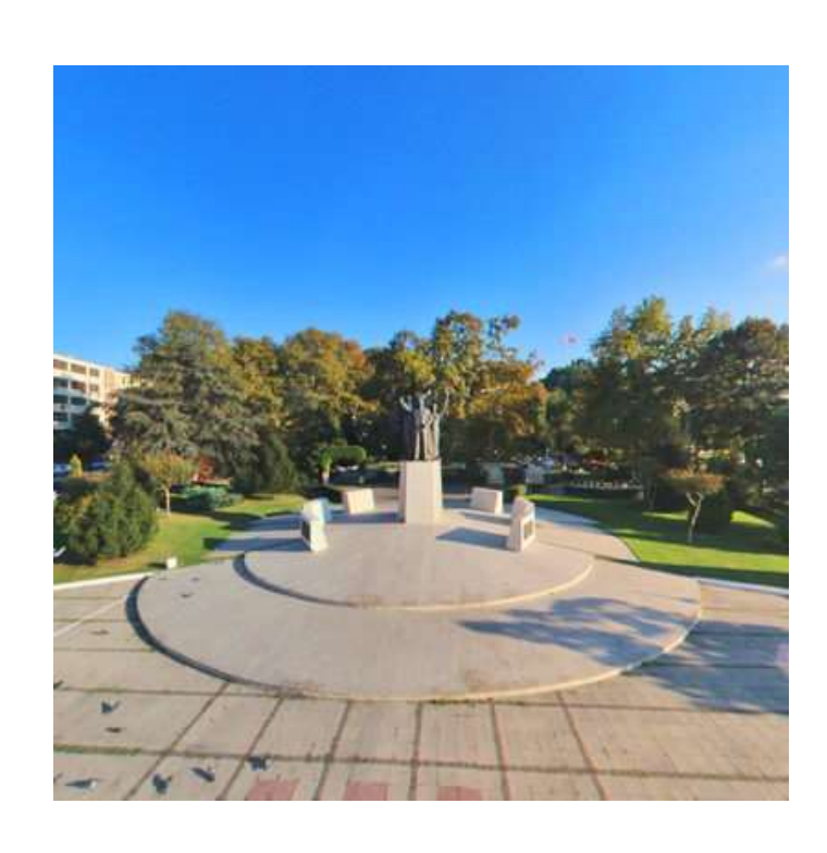
Atatürk Monument in the city square where official ceremonies were held.