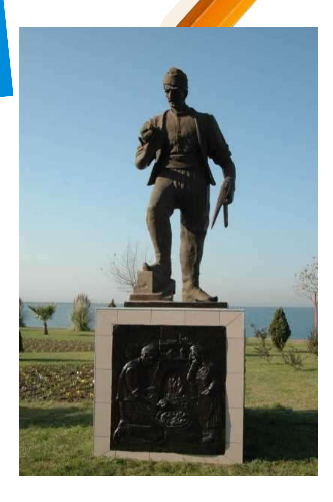
Uzun Mehmet, who found stone coal in Ereğli in 1830 and accelerated industrialization.